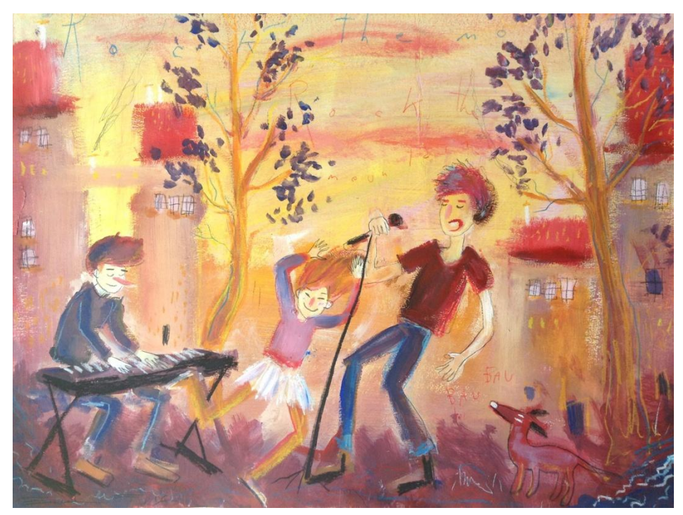
By Ester Favero

*Even though we all enjoyed the second concert, we have come to mutual opinion, that in such project there has to be only one final concert, and maybe the better option for the day would be to continue with music activities and games.