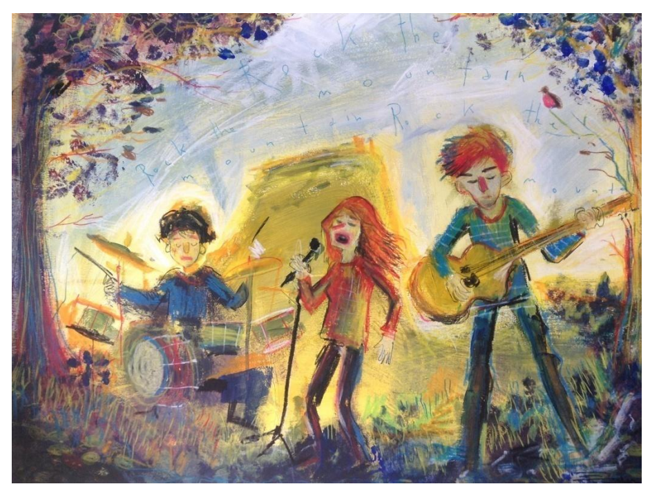
By Ester Favero (of the participants)

*The concert was a huge success. More than 200 people came for the concert, considering 800 living in Organyà. Many people posted references to the concert in social networks and Ajuntament of Organyà expressed particular gratitude to participants for creating such a cultural event for the village.